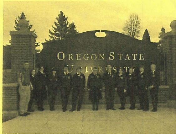
Elkton FFA members at State FFA Convention in Corvallis